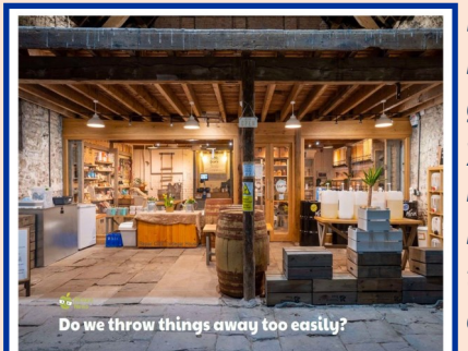
Do you think a repair cafe is a good idea? Can you think of any items in your home you could take to a repair cafe?